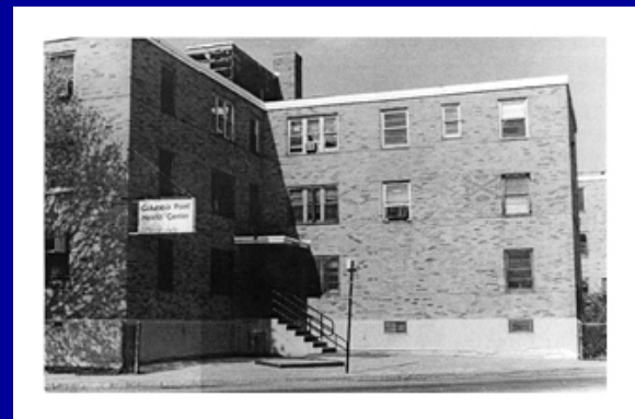
Geiger Gibson Health Center in Columbia Point Projects- 1965